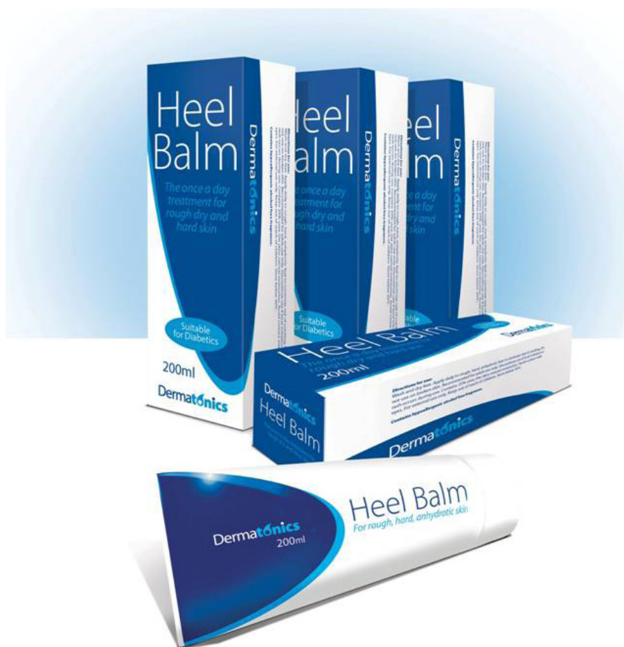
Figure 1: The heel balm used as Treatment A in the study.